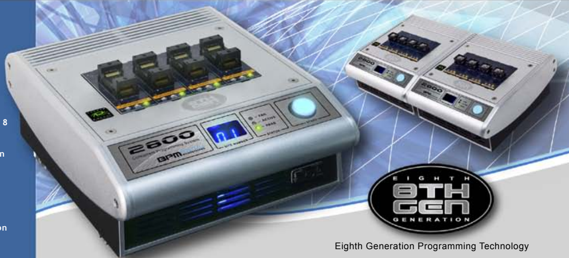
Eighth Generation Programming Technology